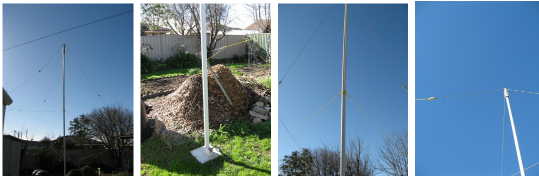
Some photo's of the 160 m Antenna Project

The AR Magazine articles should be read for more details. If you do not have the articles the AR Magazines are available to copy from the Club Library. My antenna has been used to contact ZL and interstate VK stations.