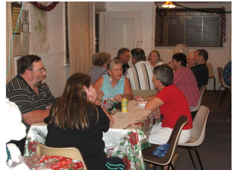
Members enjoying a Chat with drinks.