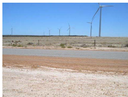
Some Windfarm pics at Geraldton