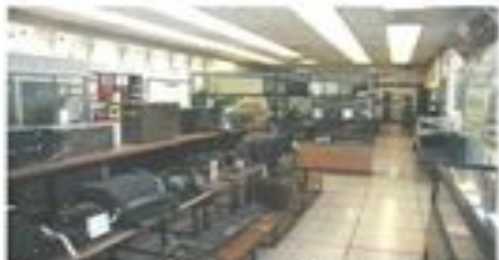
Main display hall

In 1995 the museum moved to its current location, building 147, which was formerly a satellite terminal, built in the Cold War days. It had a bright white 18 metre diameter satellite dish that attracted a lot of attention and protests as it could be seen from the surrounding suburbs. The facility was closed in 1991 and the dish was moved to Western Australia.