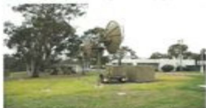
External communications shelter displays

The museum has a very good reference library and an excellent collection of operator and maintenance manuals for a very large range of military and test equipment.