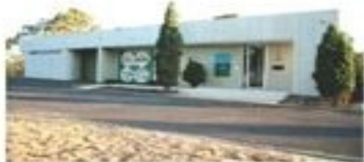
Museum building and entrance

Today much of this equipment looks basic and sometimes crude, but it was the most sophisticated and advanced technology there was. Military equipment in the WWII years used the latest techniques and concepts and they were incorporated into commercial and domestic equipment after the war. The knowledge gained from designing and constructing military equipment together with the development of solid state electronic components and mass production has resulted in the current availability of inexpensive, reliable, highly complex products.