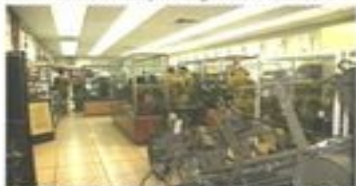
Main display hall looking in the other direction

The museum is always looking for military Signals items for its collection. It is looking for equipment, bits of equipment, books, photographs and documents. If in doubt, let the museum decide if an item is significant. Rare and historic items have been thrown out or destroyed, because their significance was not appreciated by their owners. No item is too new; today's equipment is tomorrow's history. The museum is constantly looking for new volunteers.