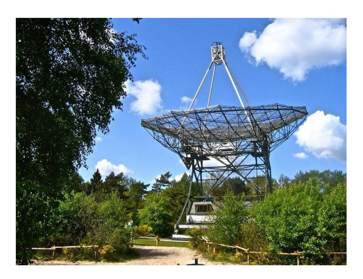
The Dwingeloo 25 meter Radio Telescope PI9CAM

More than 30 volunteers are involved in a project at the Dwingeloo 25 meter Radio Telescope to bring