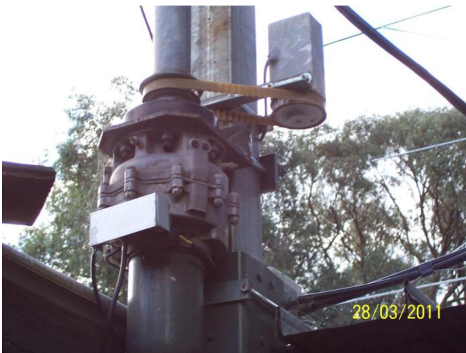
Prop Pitch Motor and Square Toothed Belt/Gear driving Azimuth Encoder

Moving the dish in both azimuth and elevation was achieved using an aircraft prop pitch motor and satellite screw jack respectively. Position information was achieved using a kit from Germany that employed rotary encoders at the dish end and a digital display in the shack. The encoders were driven using a square toothed belt for Az and direct drive for El.