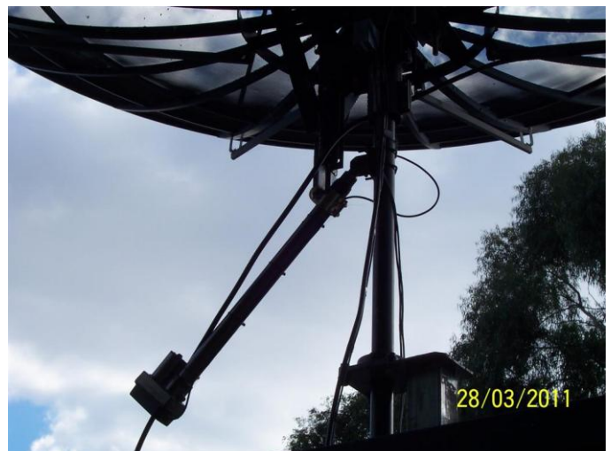
Screw Jack for driving Elevation

The dish feed uses a Septum (not shown) arrangement where there are separate antenna's for TX and RX. A G4DDK preamp (typically 0.35dB nF) was assembled and used to boost RX signals and transmit power uses a couple of 150 watt combined amps from Alan VK3XPD giving 250 watts at the feedpoint after cable losses. As the dish has approx 30dB of gain the radiated RF is quite dangerous so care has to be observed when transmitting as there is around 250kW of radiated power. This power is over a very narrow beamwidth of 3-4 degrees. On receive approx 10dB of sun noise is realised which indicates one measure of receive performance.