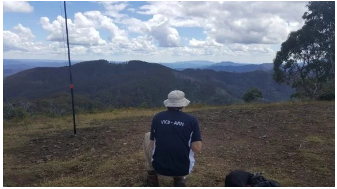
Till next time, Malcolm, VK3OAK