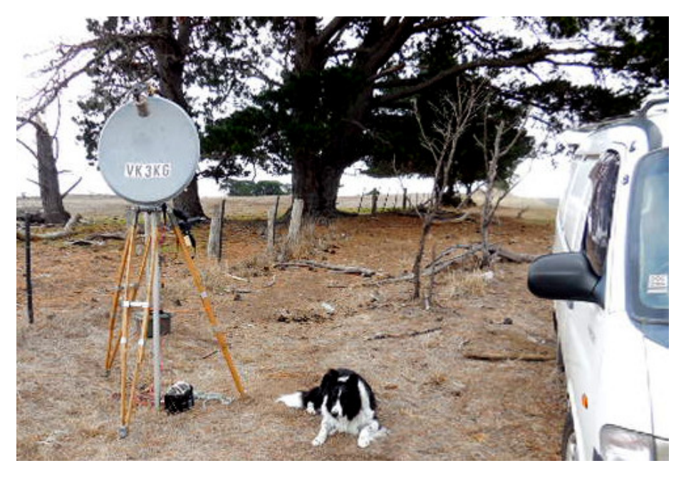
Photo of VK3KG's portable field day station taken from just off the Linton-Lismore road when a couple of us were trying out contacts on the 3.4GHz band. I have another pic taken from the front of the offset fed dish showing the home brewed "coffee can" antenna feed which illuminates the dish adequately.

This view shows the VK3XDK transverter with a 20Watt linear being mounted on the side of the main box.