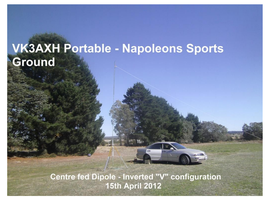
VK3AXH, Ian busy at our Field Day Contest